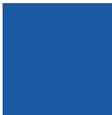
2-color logo and mark