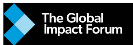
Reverse, full name