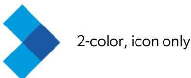
2-color, icon only