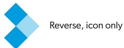
Reverse, icon only